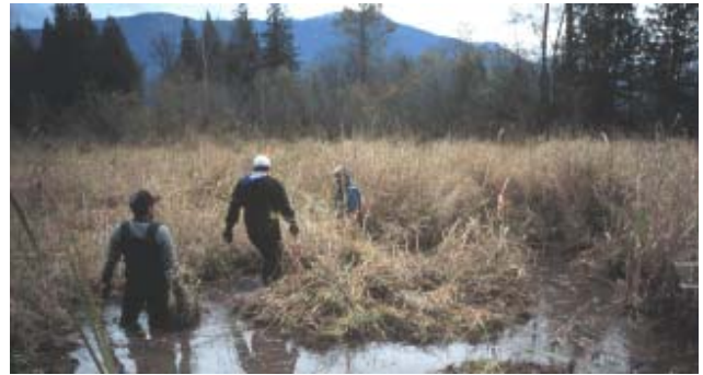
The Recovery Team and volunteers continually search for new populations of Oregon spotted frog and care for their habitat.

In the first year, the team used VI Elastomer color combinations to individually mark frogs. In the last two years we have switched to VI Alpha tags. Both systems provide an excellent method of identification without upsetting nature's way.