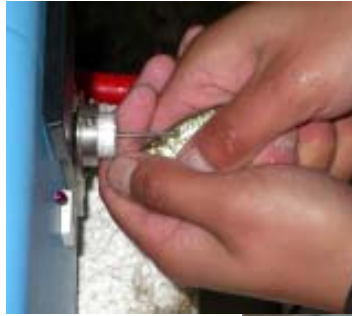
Tagging at Qinghai Fisheries Department's naked carp hatchery.

Scientists from the Qinghai Fishery Department approached Northwest Marine Technology in 2002 during a Coded Wire Tag Workshop that was held in conjunction with the World Aquaculture Society meeting in Beijing, China.