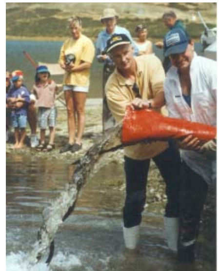
Juvenile eels being released into Lake Hawea in 1998 as a crowd gathers to witness the event.