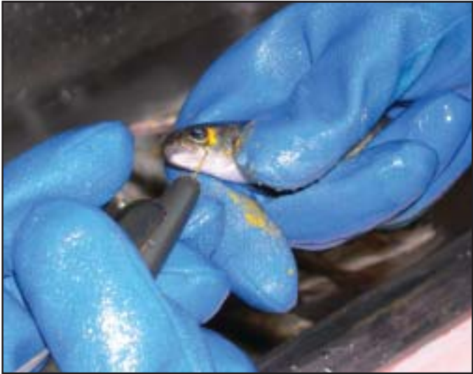
VIE has been used to evaluate Atlantic Salmon at NOAA fisheries Maine Field Station

The elastomer material and supplies for injection are sold in increments of 1,000 marks. NMT supplies the marks for this system by way of a token. When inserted into the machine this token allows the user to make the number of injections purchased. Tags can be downloaded from the token onto various machines.